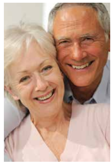
PLEASE CONSIDER INCLUDING LOS ANGELES MISSION IN YOUR WILL

Los Angeles Mission exists to provide help, hope, and opportunity to men, women and children in need. These figures represent services provided through May 2018.