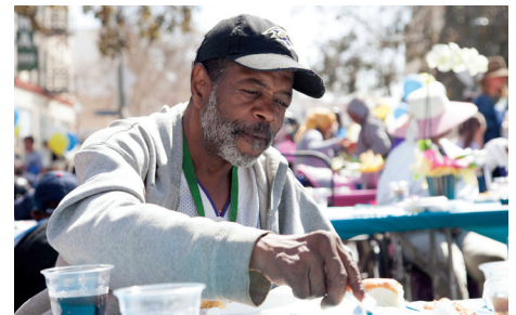
A hot meal and cup of coffee can brighten a day and renew the soul.