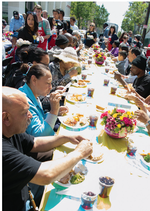
Your help gives Easter hope to neighbors in need.

We hope you'll support these efforts with a generous gift so we can provide hope-filled Easter meals and basic necessities to our neighbors who need it most.