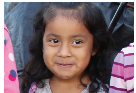
Thank you for creating special childhood memories for boys and girls this Easter.