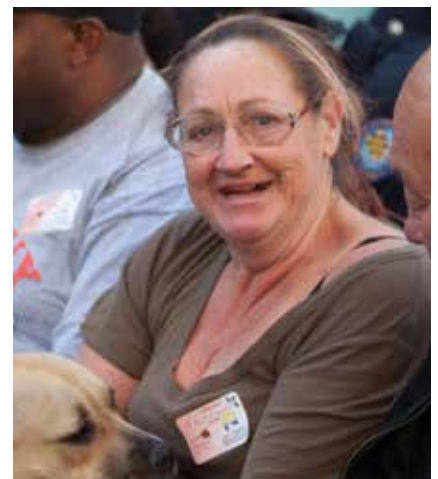
This time of year, new life often begins with a good meal.

There's no better way to spend $2.03 this Thanksgiving!