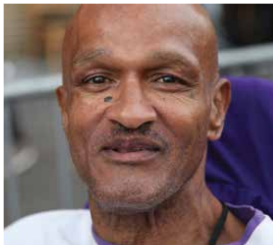
Thank you for giving a happy Thanksgiving to those who need it most.