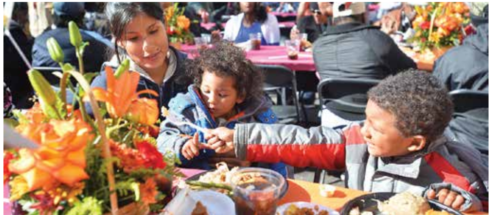
This Thanksgiving, you can give hope to hurting women, families and children.

The event will brighten the day of someone who would otherwise be spending the holidays alone and hungry. We hope you'll support your friends and neighbors with a generous gift to provide nutritious Thanksgiving meals and basic care.