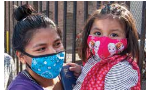
Thank you for your support during this time of renewal.