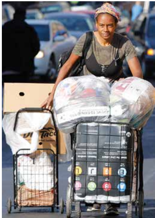
Your help will give hope to someone who is hurting.

Please support the Mission with a generous gift today! Thank you!