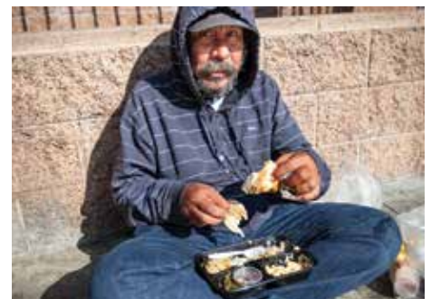
Feeding a hungry soul is the first step to a changed life.

Every $2.53 feeds one hungry person, opening the door to hope and new life.