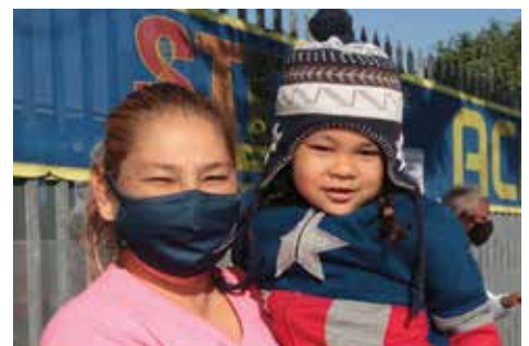
When you partner with Los Angeles Mission, lives are changed.

Every $2.53 feeds one hungry person, opening the door to hope and new life.