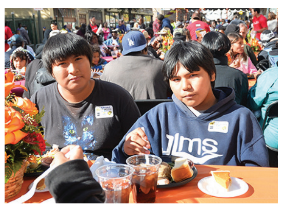
This Thanksgiving, you can give hope to hurting women, families and children.

Please support these efforts with a generous gift so we can provide hope-filled Thanksgiving meals to our neighbors who need them most.