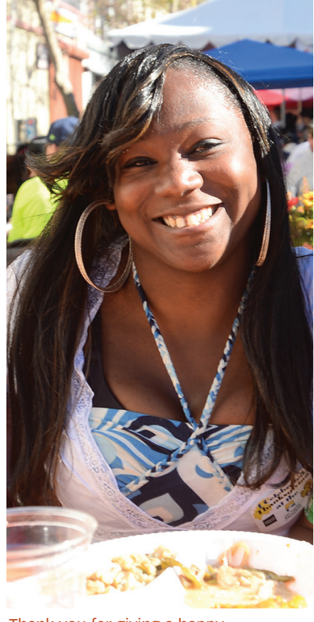
Thank you for giving a happy Thanksgiving to those who need it most.

There's no better way to spend $2.53 this Thanksgiving!