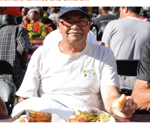
This time of year, new life often begins with a good meal.