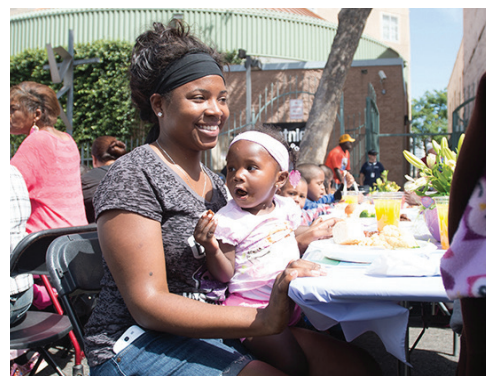
Feeding a hungry soul is the first step to new life this Easter season.

Every $2.53 feeds one hungry person, opening the door to hope and new life.