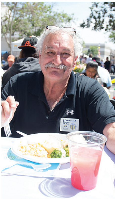
Easter is rapidly approaching, and we need your help right away!

Please support the Mission with a generous gift today! Thank you!