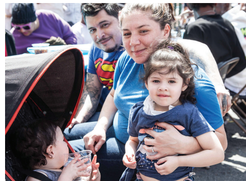
Your help will give hope to someone who is hurting.