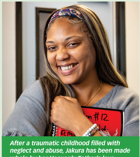
whole by her Heavenly Father's love.

Will you please help? Your compassion for our neighbors in need will transform the lives of many struggling families, especially the children. Thank you, and God bless you.