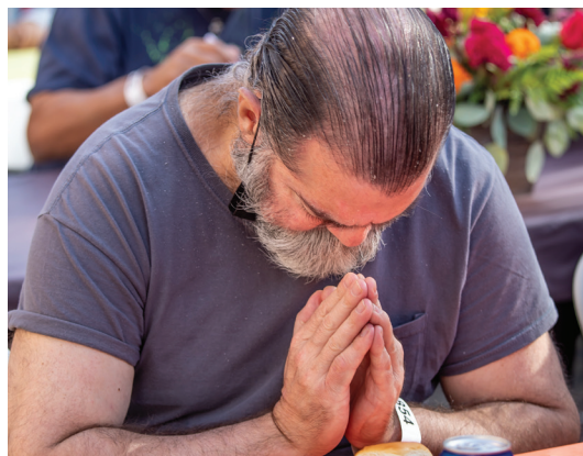
Hope and transformation can begin with a good meal.