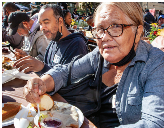
Thank you for giving our guests a reason to be grateful this Thanksgiving.

Please send your generous gift today to provide hope-filled Thanksgiving meals to men, women and children in critical need.