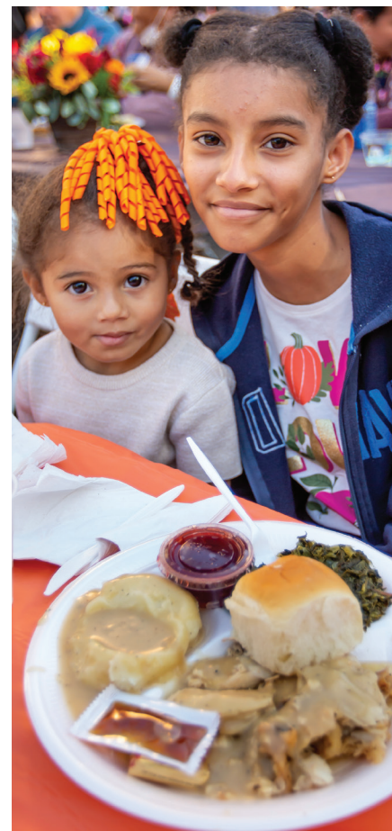
Give hope to hurting women, families and children with a $2.53 meal.

There's no better way to spend $2.53 this Thanksgiving!