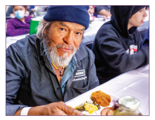
As record numbers turn to the Mission this Easter season, we need your help!

Please support the Mission with a generous gift today! Thank you!