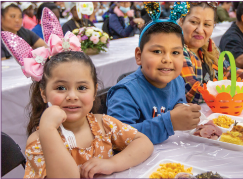
Your compassion can lift a neighbor off the streets of Skid Row.