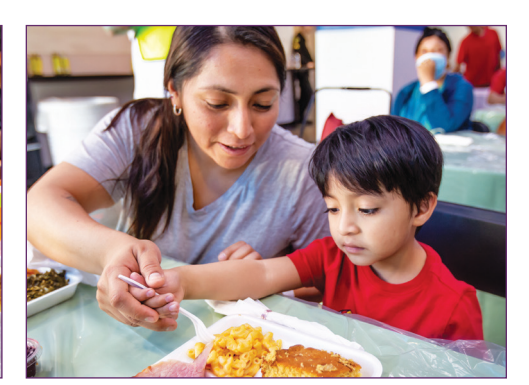
By God's grace, the $2.53 meals you provide will inspire transformation.